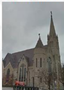
Calvary 821 S. 4th St.