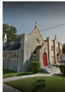
St. George's 1201 S. 26th St.