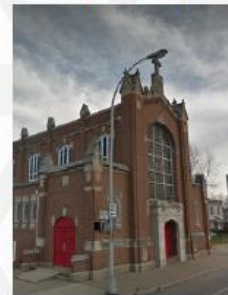
Our Merciful Savior 473 S. 11th St.