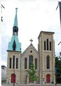
Christ Church Cathedral 421 S. 2nd St.